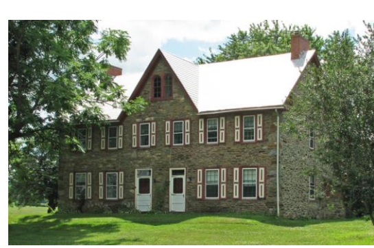
Eusebius Barnard House in Pocopson owned by Pocopson Township, being preserved, is a park, portion will house Kennett Underground Railroad Center office