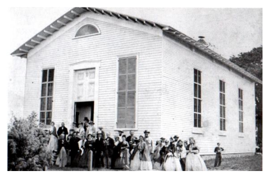
Longwood Progressive Friends Meeting owned by Longwood Gardens & currently houses Brandywine Valley Conference & Tourist Center